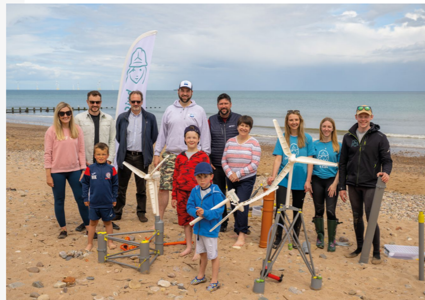
Offshore Wind 4 Kids demonstration, Aberdeen Beach, June 2022.

Please contact us at supplychain@muirmhor.co.uk to register your interest in supply chain opportunities.