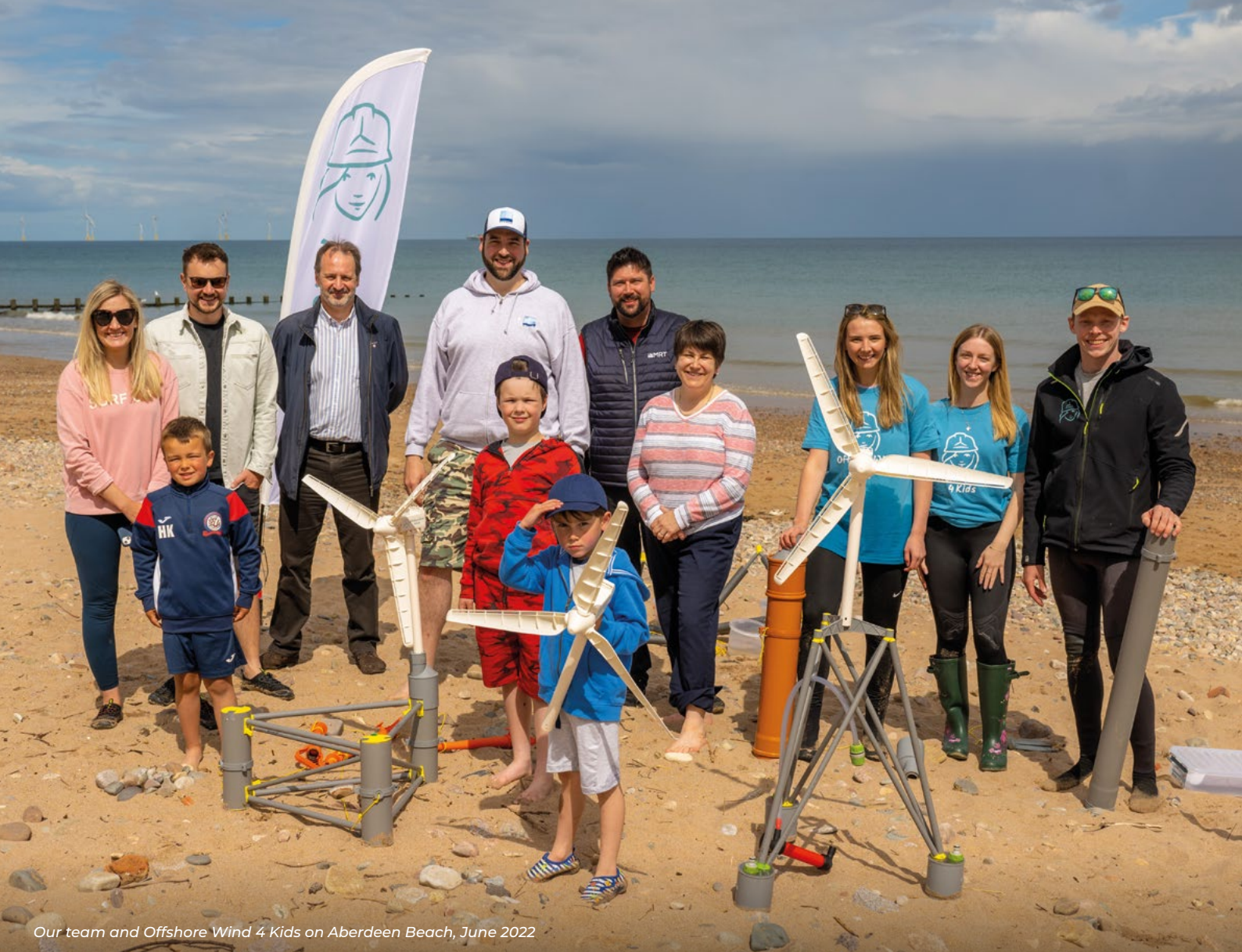
Our team and Offshore Wind 4 Kids on Aberdeen Beach, June 2022