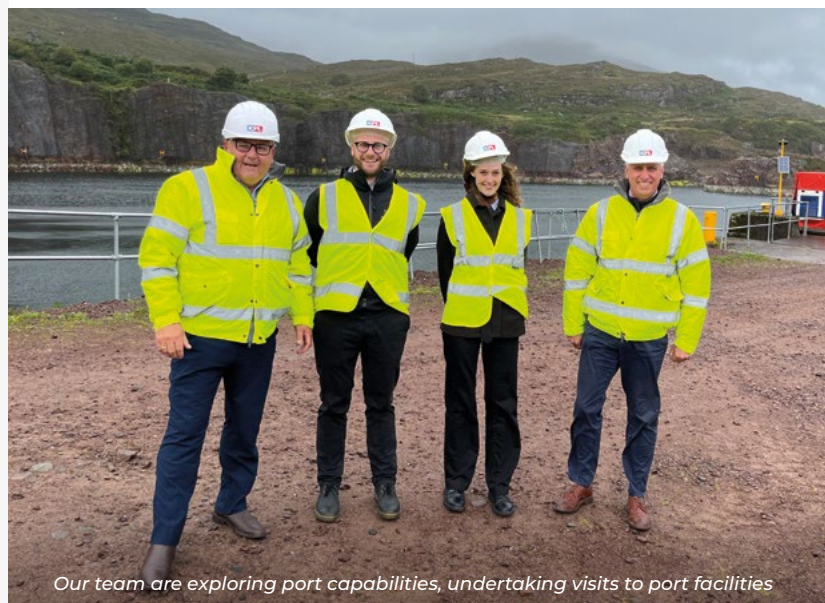
Our team are exploring port capabilities, undertaking visits to port facilities

“Muir Mhòr has conducted the earliest & best supply chain engagement to date”